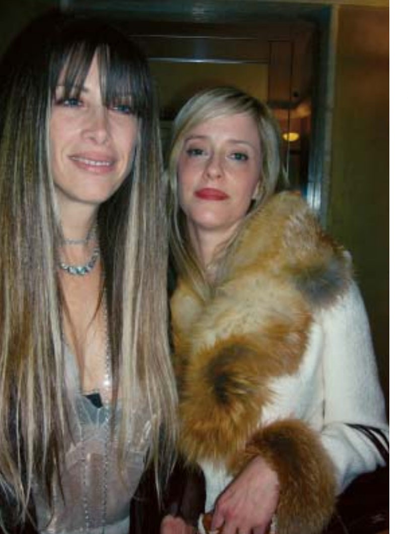
Juicy Girls - Paris