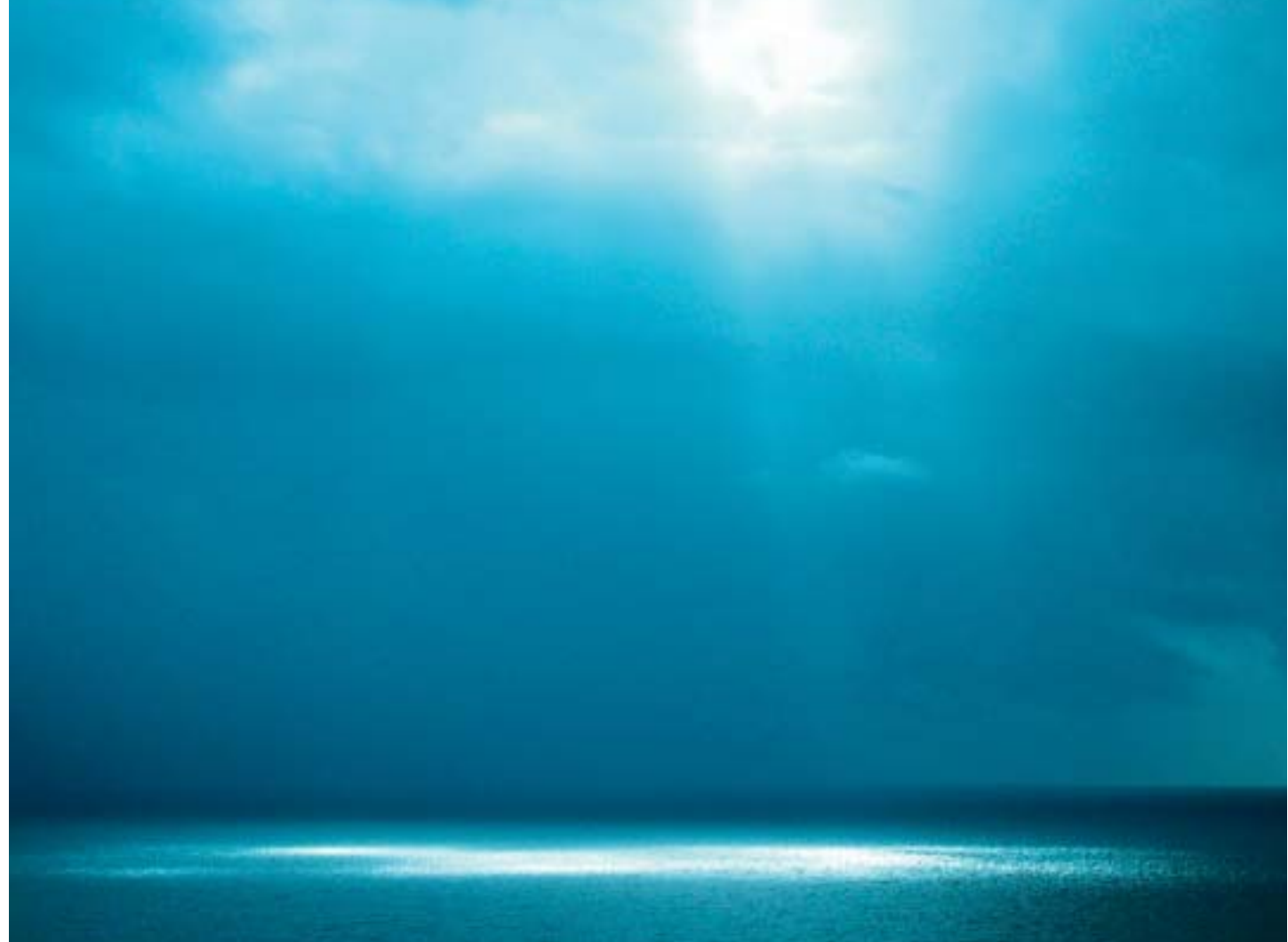
Light on the water - Barcelona