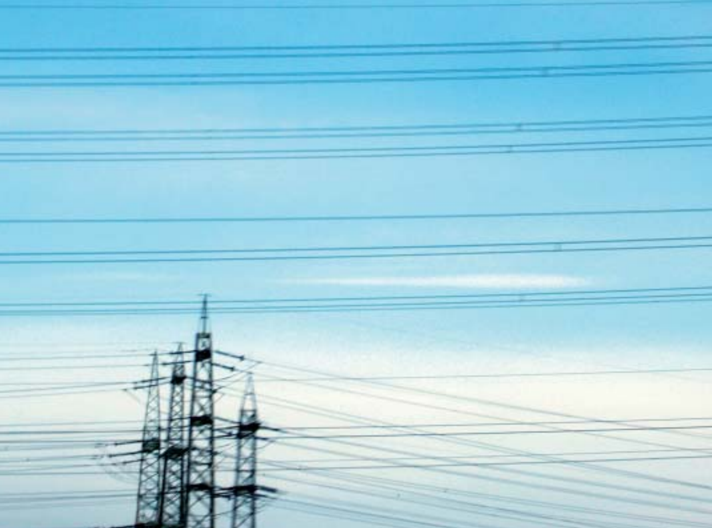
Wires on the highway