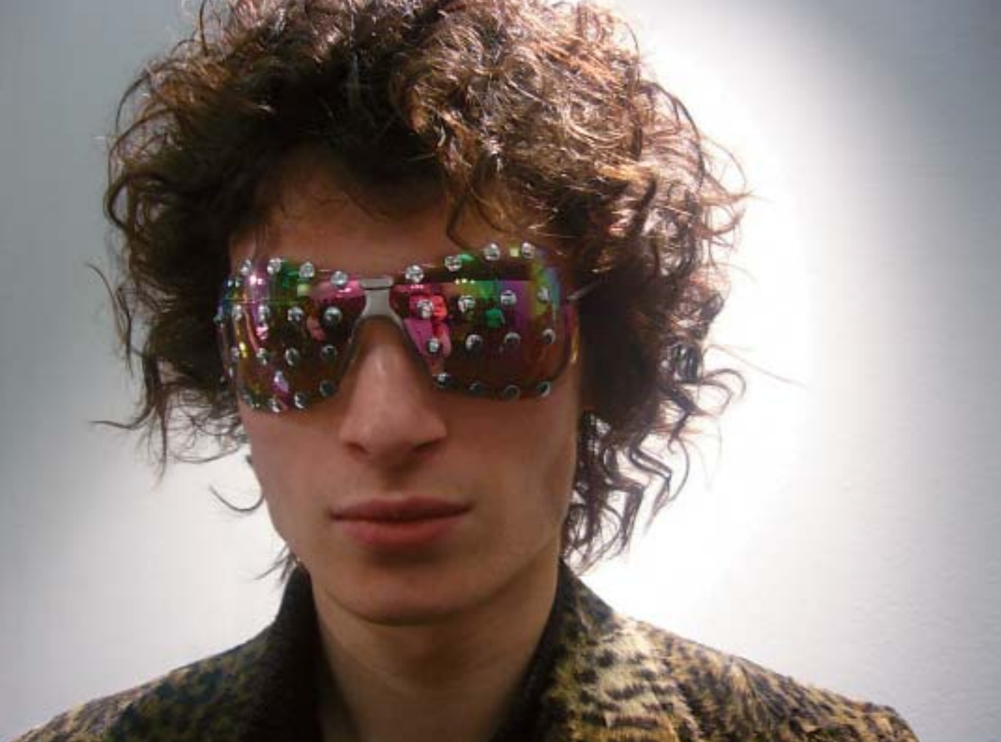
John Richmond glasses - Milan