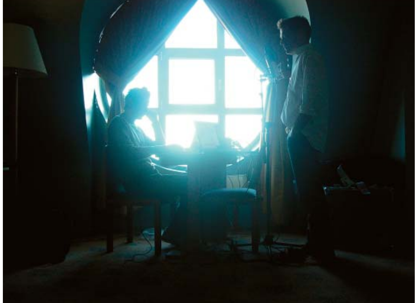
Recording in Antwerp - 03