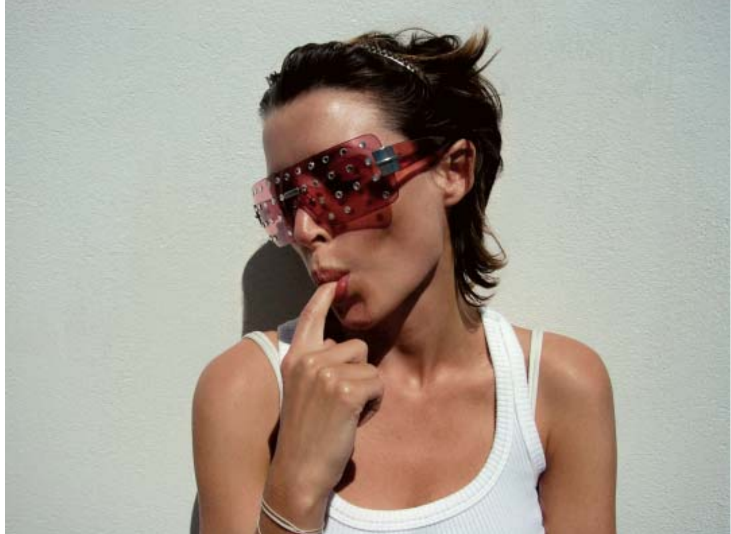
Dannii Minogue - South Africa