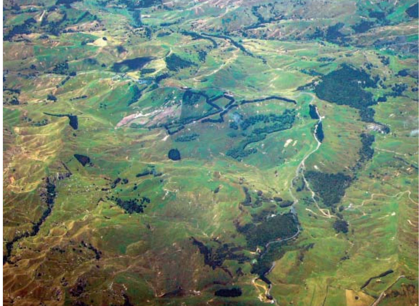
Over New Zealand