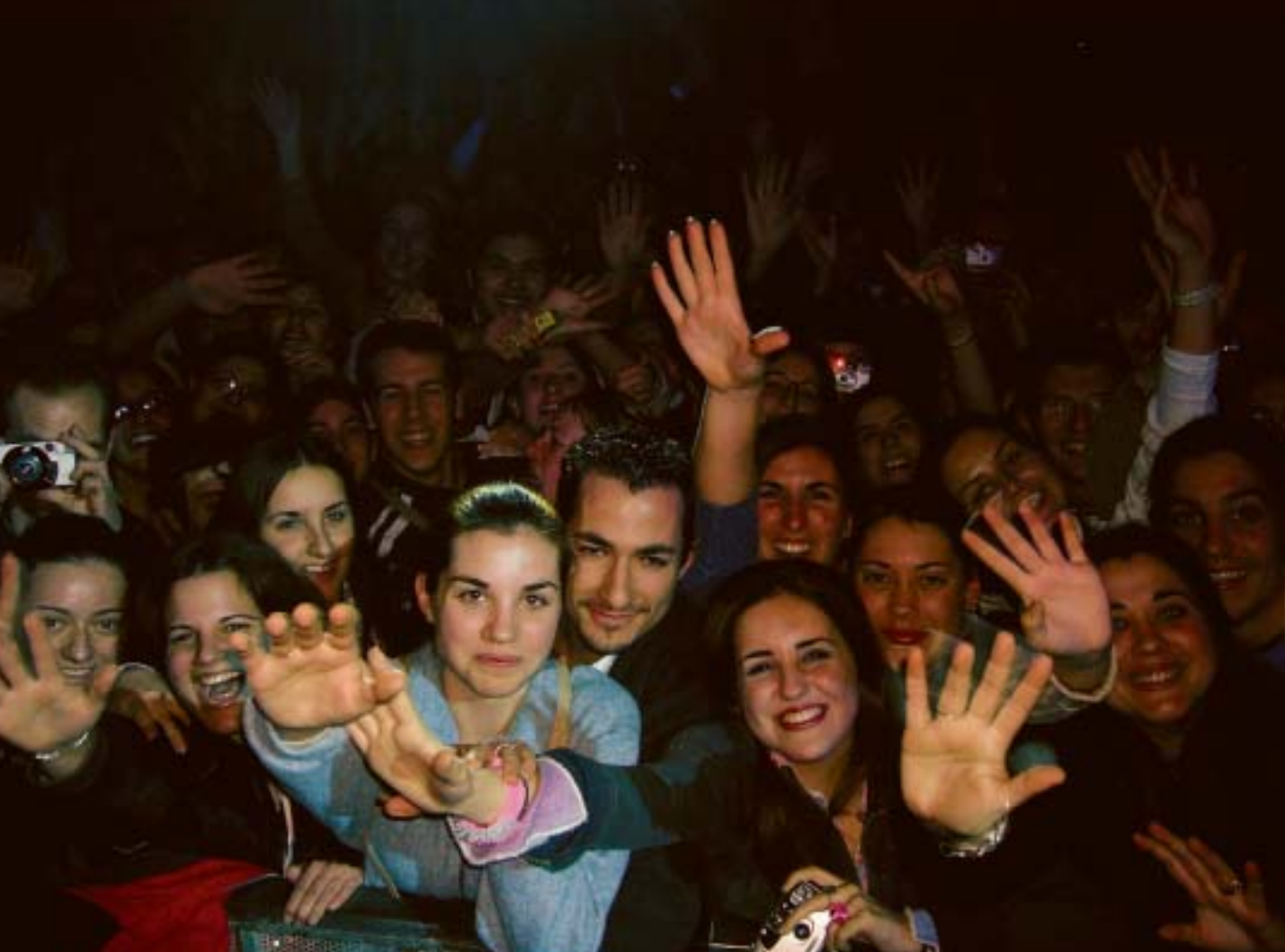
Crowd in Alicante