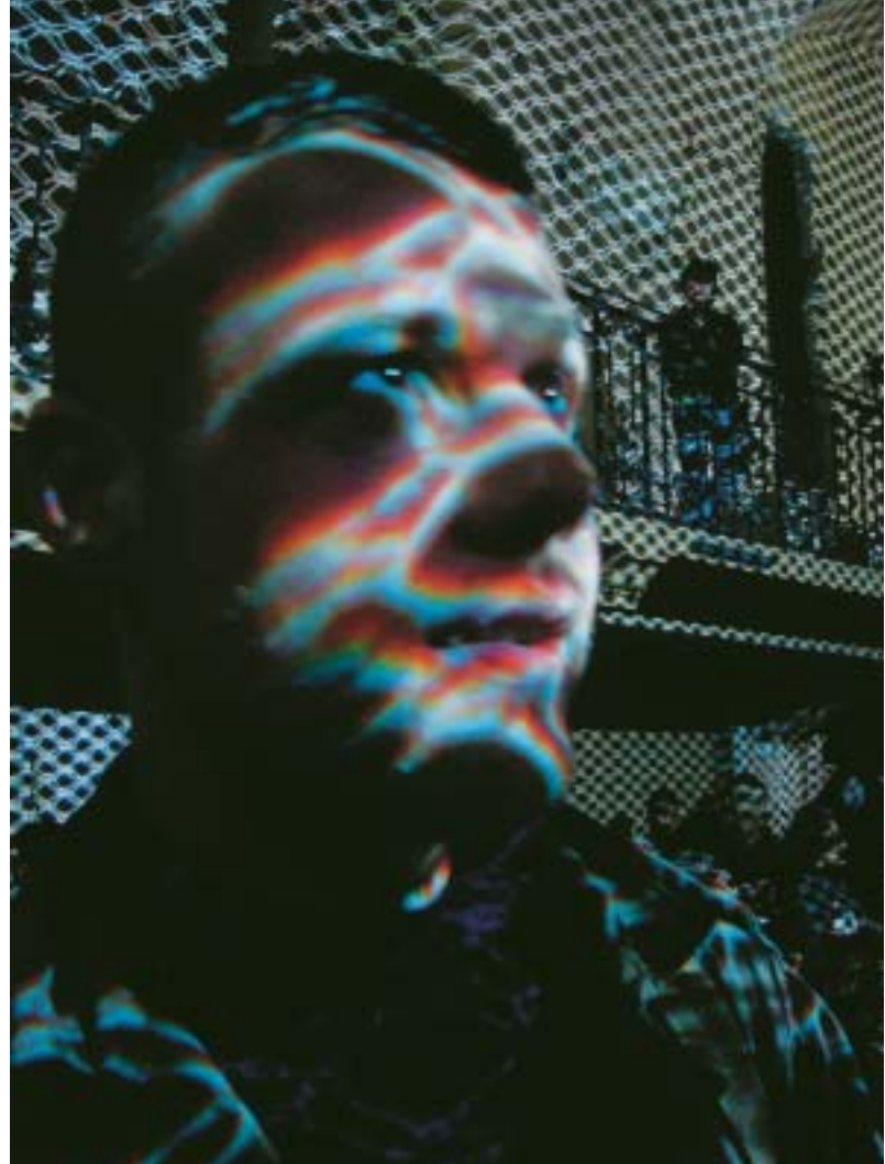
Jean-Paul Gaultier Show - Paris