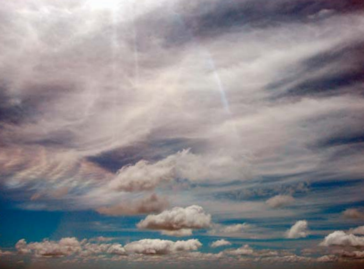
Sky over New Zealand