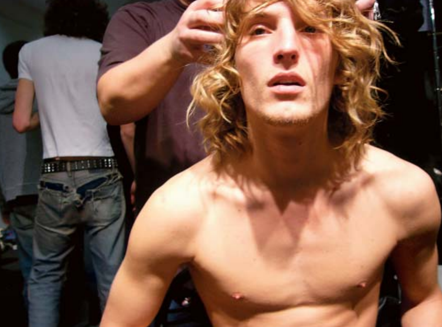
John Richmond Show - Milan