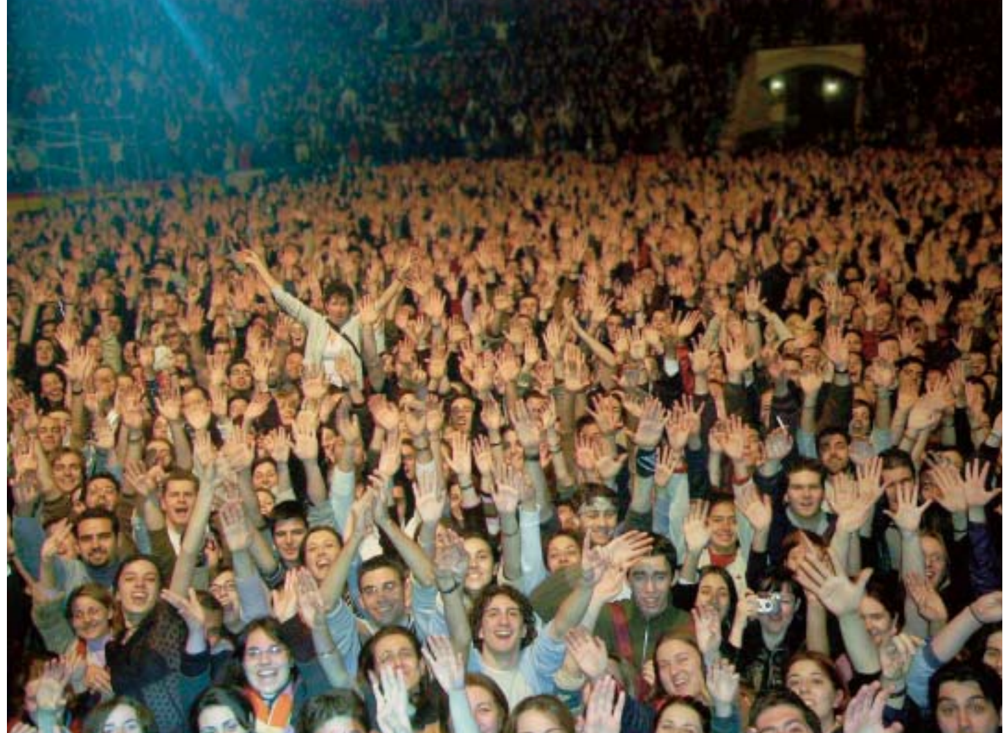
Crowd in Madrid