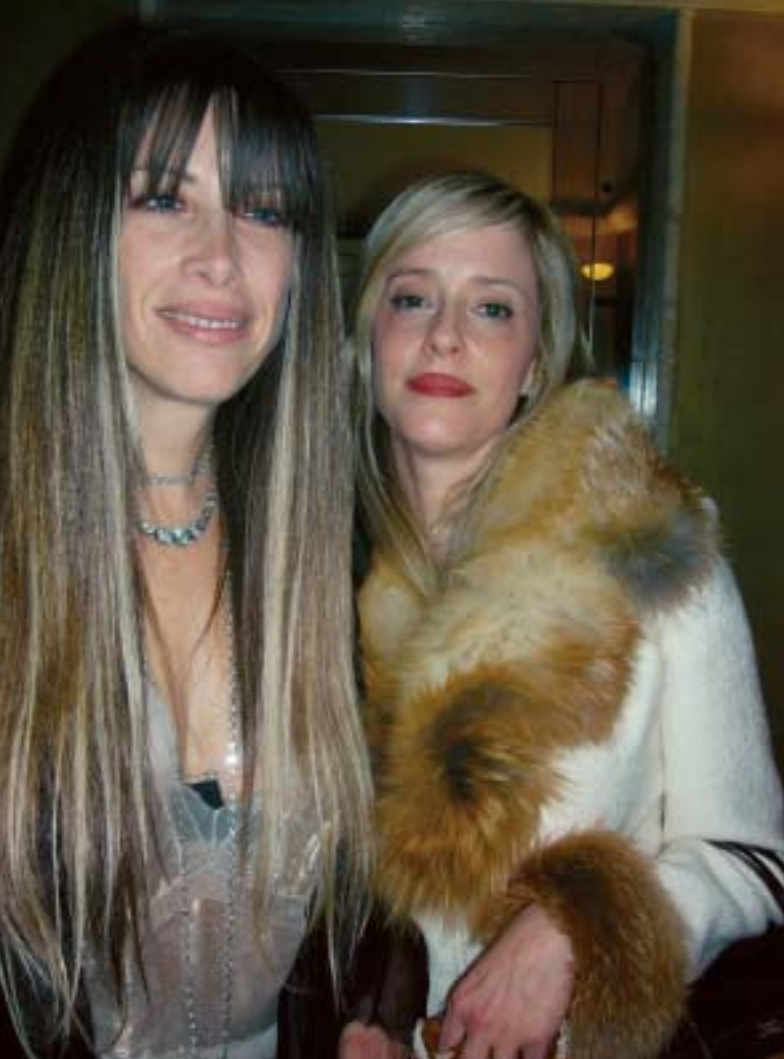
Juicy Girls - Paris