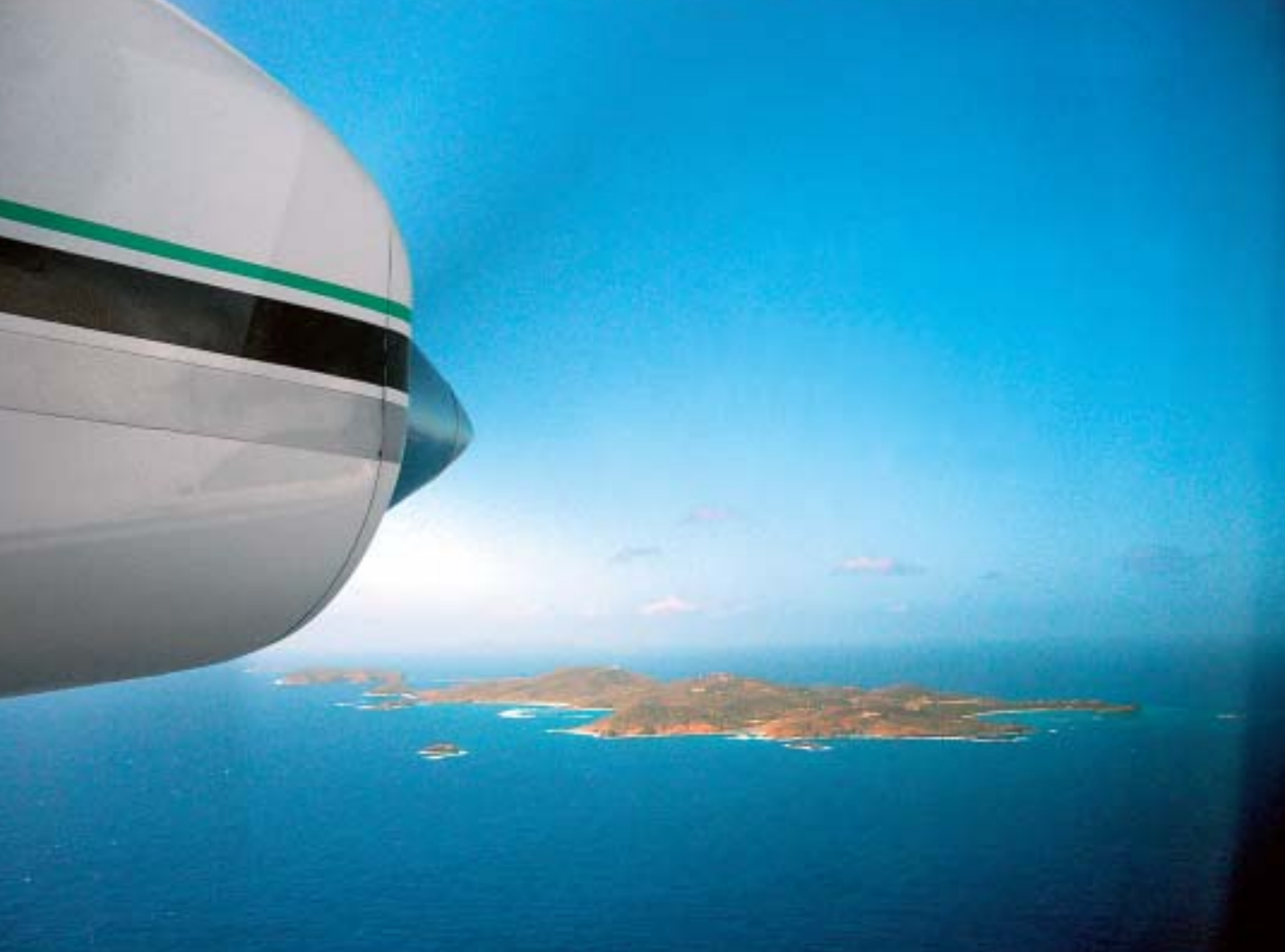
Flying into Paradise