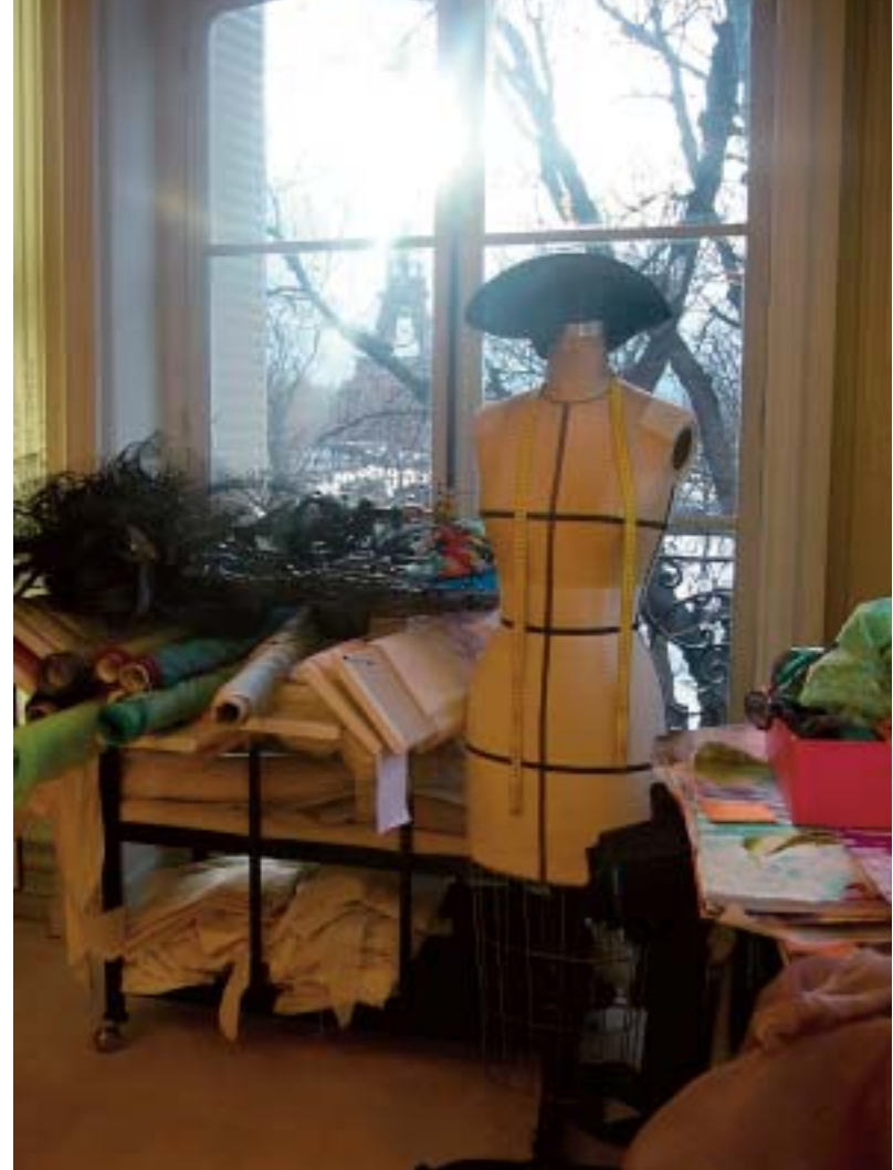
Atelier Ungaro - Paris