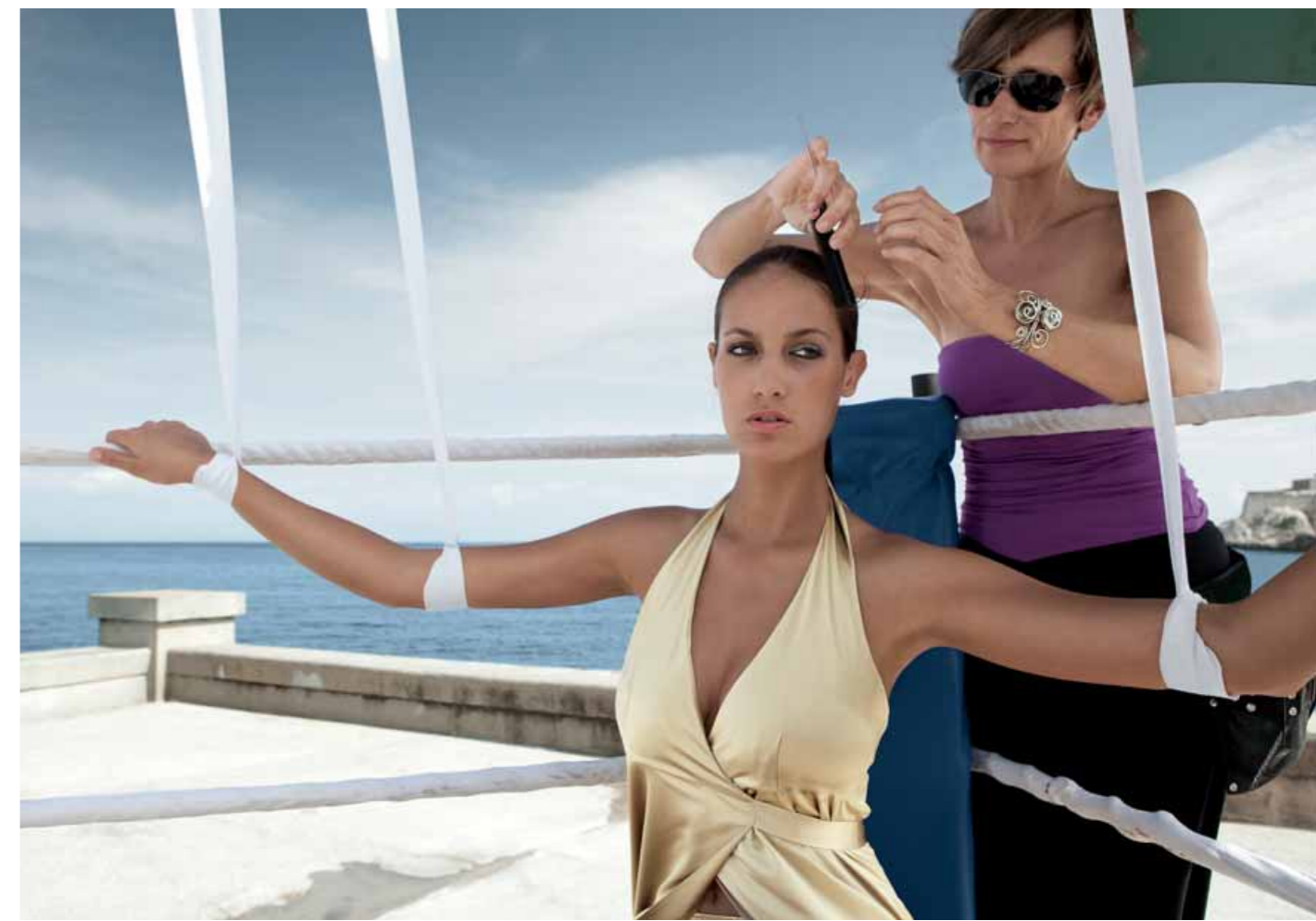
Style change: for the next shots the hair / makeup stylist lends a hand again.

The world is constantly in motion. And that's the way it should be. With the Leica X1 the photographer is endowed with such flexibility that she or he can capture each situation and impression exactly as it is: authentic and unrehearsed. The autofocus zeroes in on the subject, the automatic exposure selects the best aperture and shutter speed, and the array of automatic functions perform with flawless precision. Click! It all happens within a fraction of a second, if you wish. But of course photographers can take control of the process at any moment, defining the parameters according to their inspiration. Spontaneous or purposeful, the Leica X1 is always the right choice.