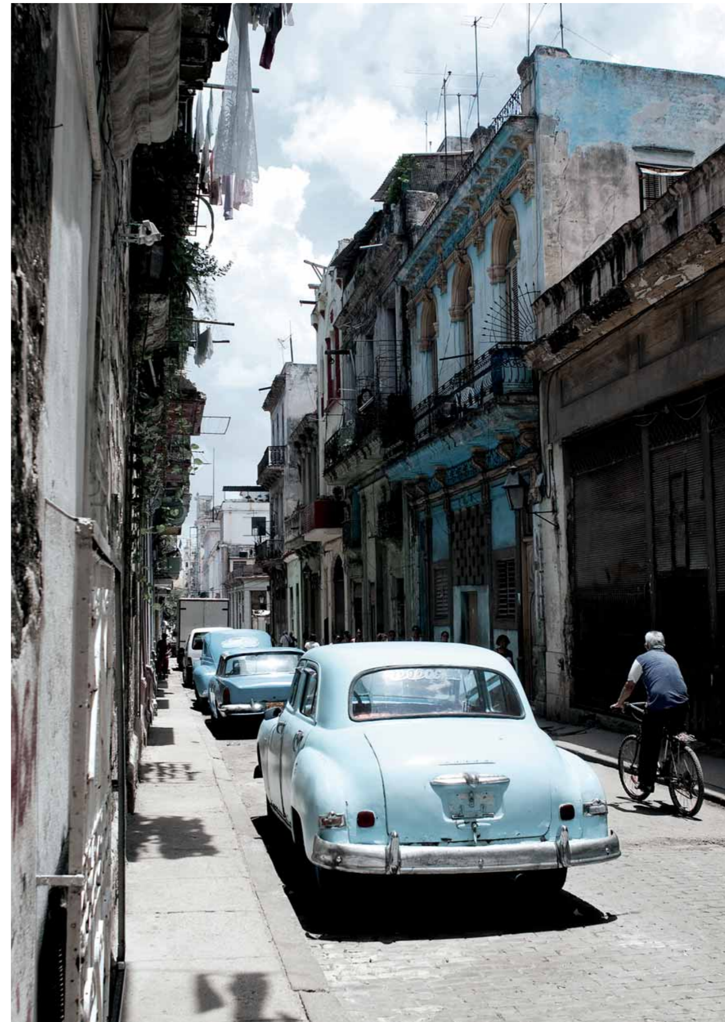
The sun shines again on the way back to the hotel. The heavy storm is forgotten.